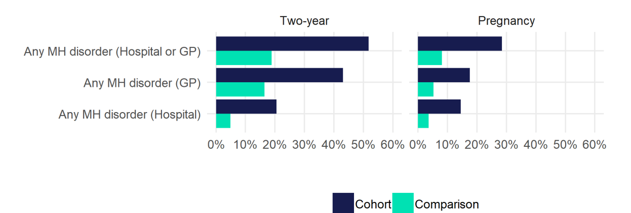
Figure 2: Percentage of mothers with depression or anxiety disorders for periods of two years preceding birth and during pregnancy, by GP, hospital, or combined GP and hospital measure